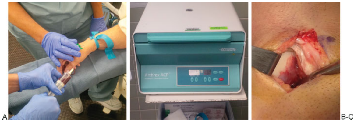
Fig. 2 (A) A blood draw is performed on the patient intraoperatively after the induction of anesthesia. (B) The blood is spun down in a centrifuge to separate out the platelet-rich plasma. (C) The platelet-rich plasma is placed at the microfracture site with a fibrin glue sealant.

uses for PRP continue to be studied with higher levels of evidence, with the hope that more definitive conclusions can be made either in favor of or against routine use in the orthopedics.