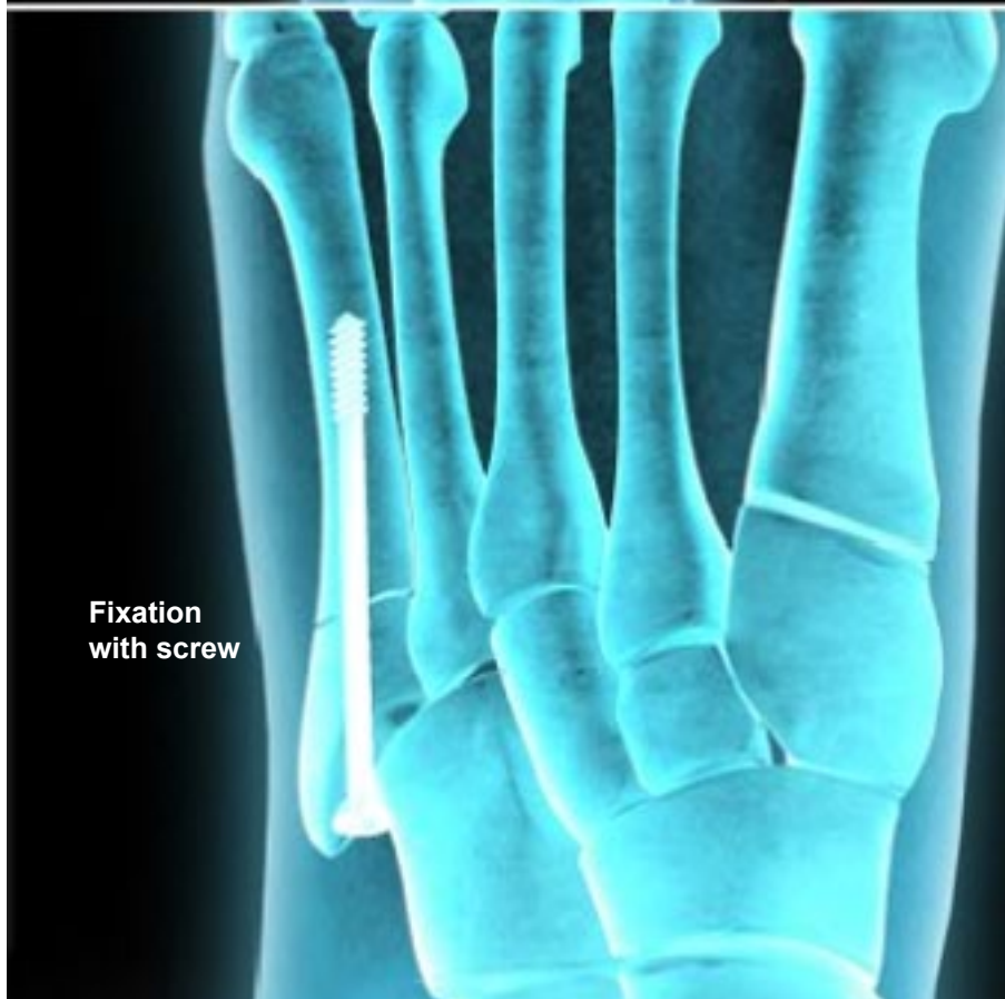
Fixation with screw